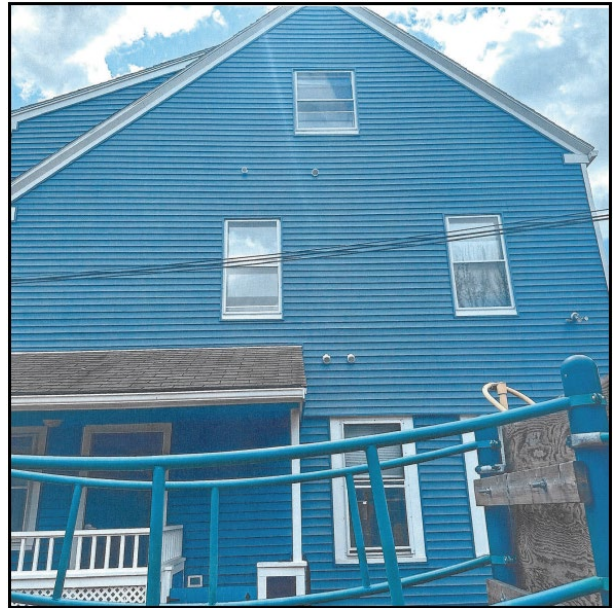
Right: Right Elevation